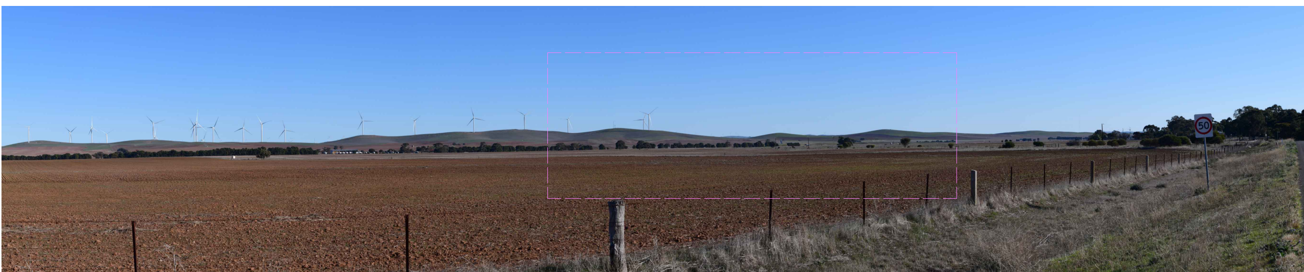
Photomontage PM1 - Existing 120 degree field of view south west to north north west from The Government Silos Road. Approximate distance to closest wind turbine 4.5km