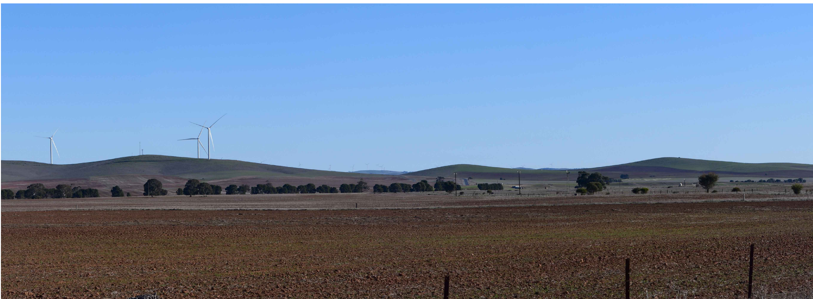
Photomontage PM1 - Existing detail 40 degree field of view