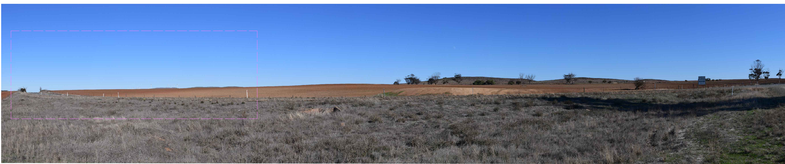
Photomontage PM4 - Existing 120 degree field of view south west to north north west from Uooloo Road (across Barrier Highway). Approximate distance to closest wind turbine 1.3km