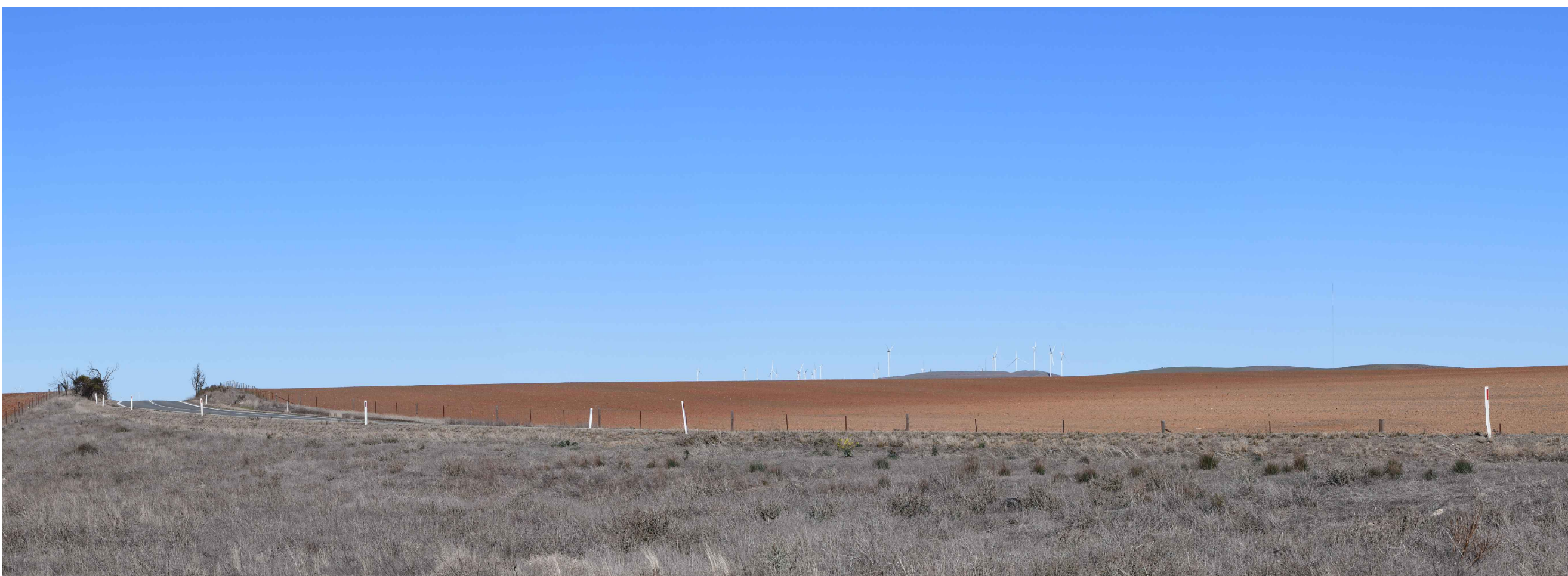
Photomontage PM4 - Existing detail 40 degree field of view